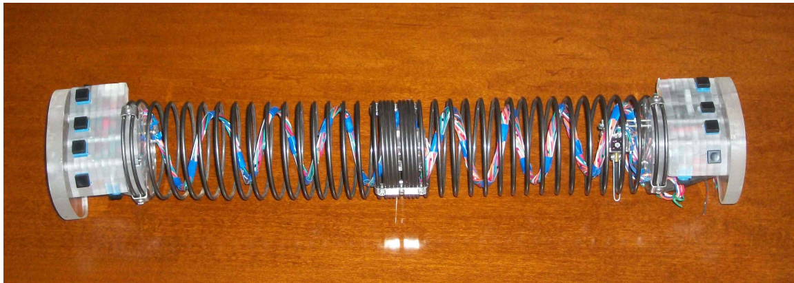
Fig 1. Sonik Spring

The Sonik Spring™ was created as an interface to make the performer feel as if they were sculpting and touching sound and visual data in real-time. Using hand, wrist and arm motions, the performer directly translates discernible actions into a strongly grounded sonic-visual narrative. [1]