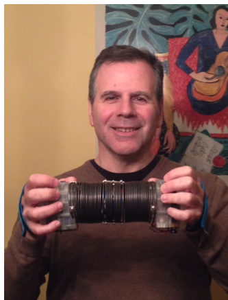
Fig 2. Fully compressing the Sonik Spring

The Sonik Spring™ has an unstrained length of 15-inches and a diameter of 3-inches. Overall length varies from 7.5-inches to 30-inches, a 4:1 ratio that is uniquely intuitive for applying mapping algorithms. The spring is attached to hand controllers which house orientation sensors and multi-purpose switch buttons. A wireless transmitter is housed within the right hand controller and collects information from ten analog sensors and ten switch buttons [6]. This information is sent to a computer running the Max software application, which processes all the data. The Sonik Spring™ can synthesize audio and video on the fly. To play and modify pre-recorded audio, it uses a granular synthesis software engine.